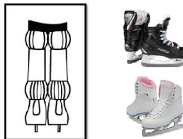
MOLDED PLASTIC SKATES ARE NOT PREFERRED AS THEY DO NOT PROVIDE GOOD FIT OR SUFFICIENT ANKLE SUPPORT.